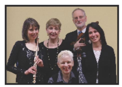
All Seasons Chamber Players