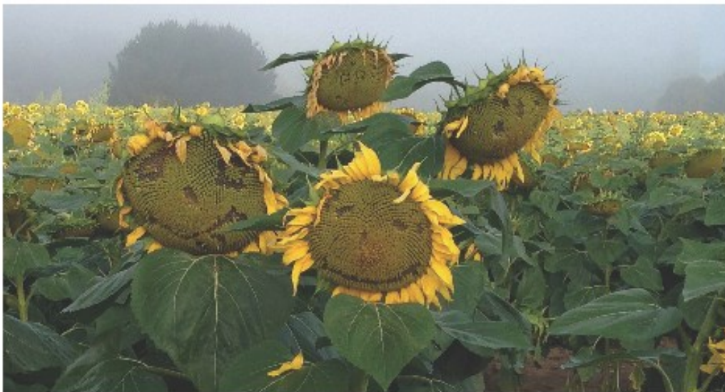
Camino de Santiago

Please join the Environmental Justice Committee for coffee hour in a celebration of Earth Day on Sunday, April 21. We'll have a special treat and lots of information about how we can lighten our footprints as we tread on Mother Earth. This year's focus will be on alternative energy sources and a display of some earth friendly swaps for everyday use.